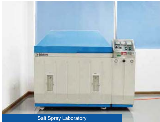
Salt Spray Laboratory