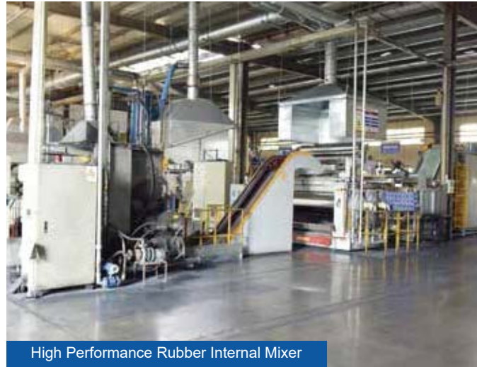
High Performance Rubber Internal Mixer