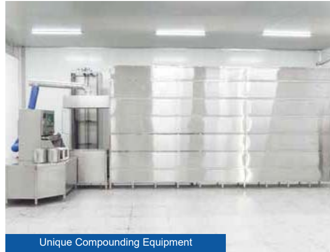
Unique Compounding Equipment