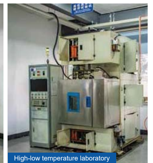
High-low temperature laboratory