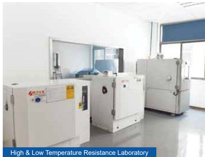
High & Low Temperature Resistance Laboratory